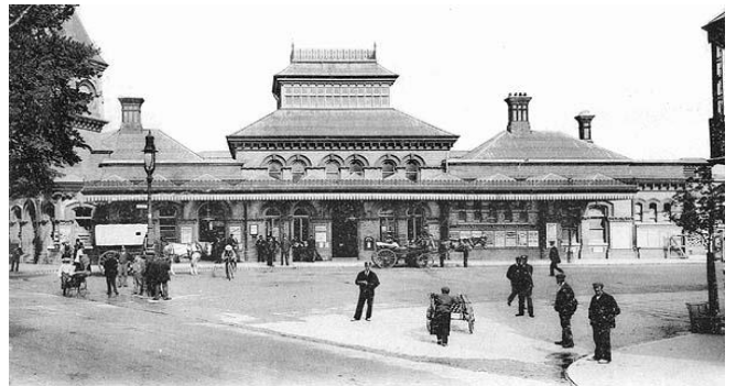
Victorian train station